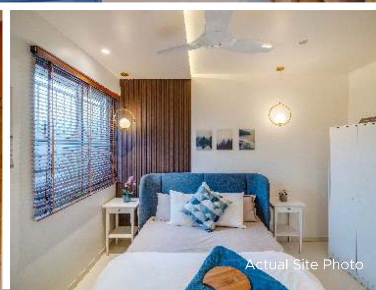
Actual Site Photo