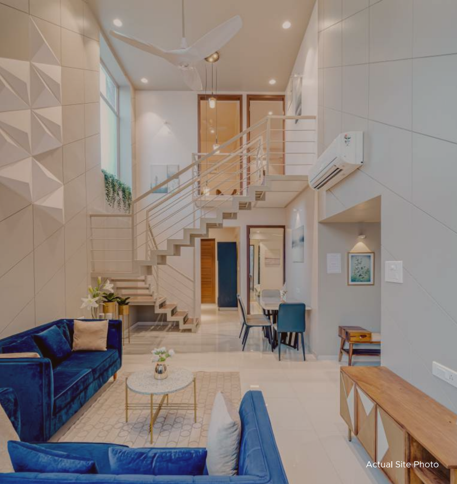
Actual Site Photo