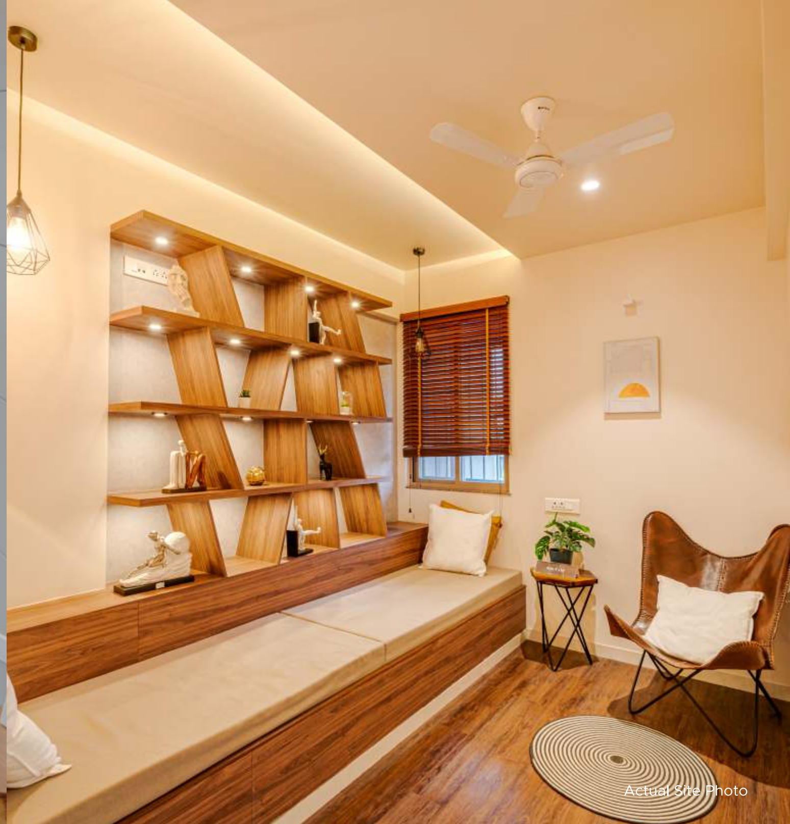
Actual Site Photo