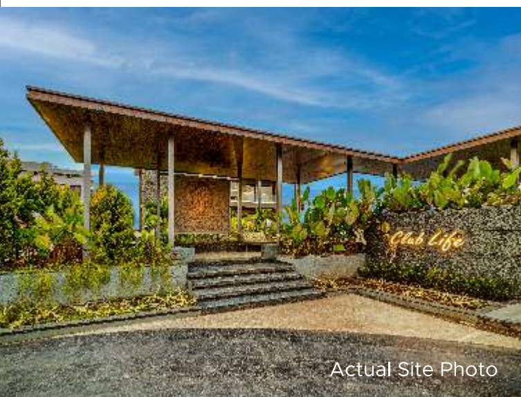
Actual Site Photo

Pirangut is one of the most thriving suburbs in the Western parts of Pune. It enjoys quick connectivity with Pune city and also facilitates easy access to NH48. On the western side it is in close proximity to the Lavasa project. Over the years it has witnessed significant industrialization and modernisation. India's most prominent IT Hub at Hinjewadi is very much in the neighbourhood and that's why Pirangut enjoys the most vantage position.