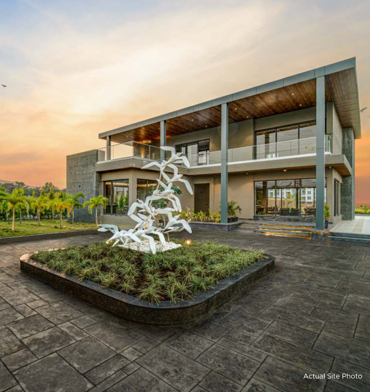
Actual Site Photo