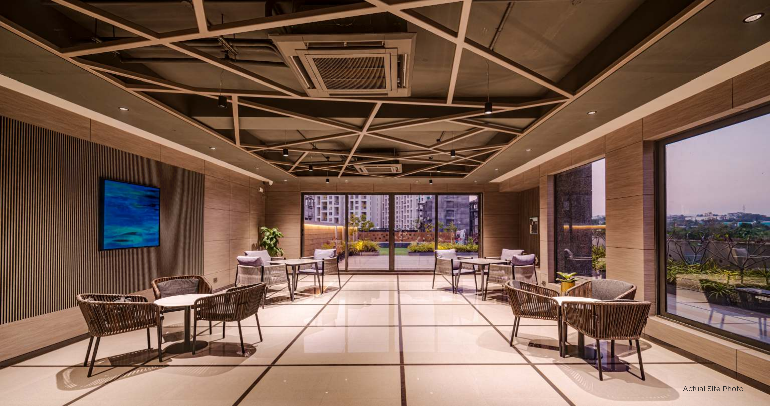
Actual Site Photo