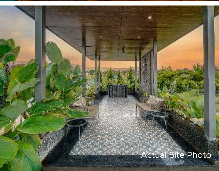
Actual Site Photo