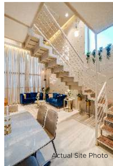
Actual Site Photo