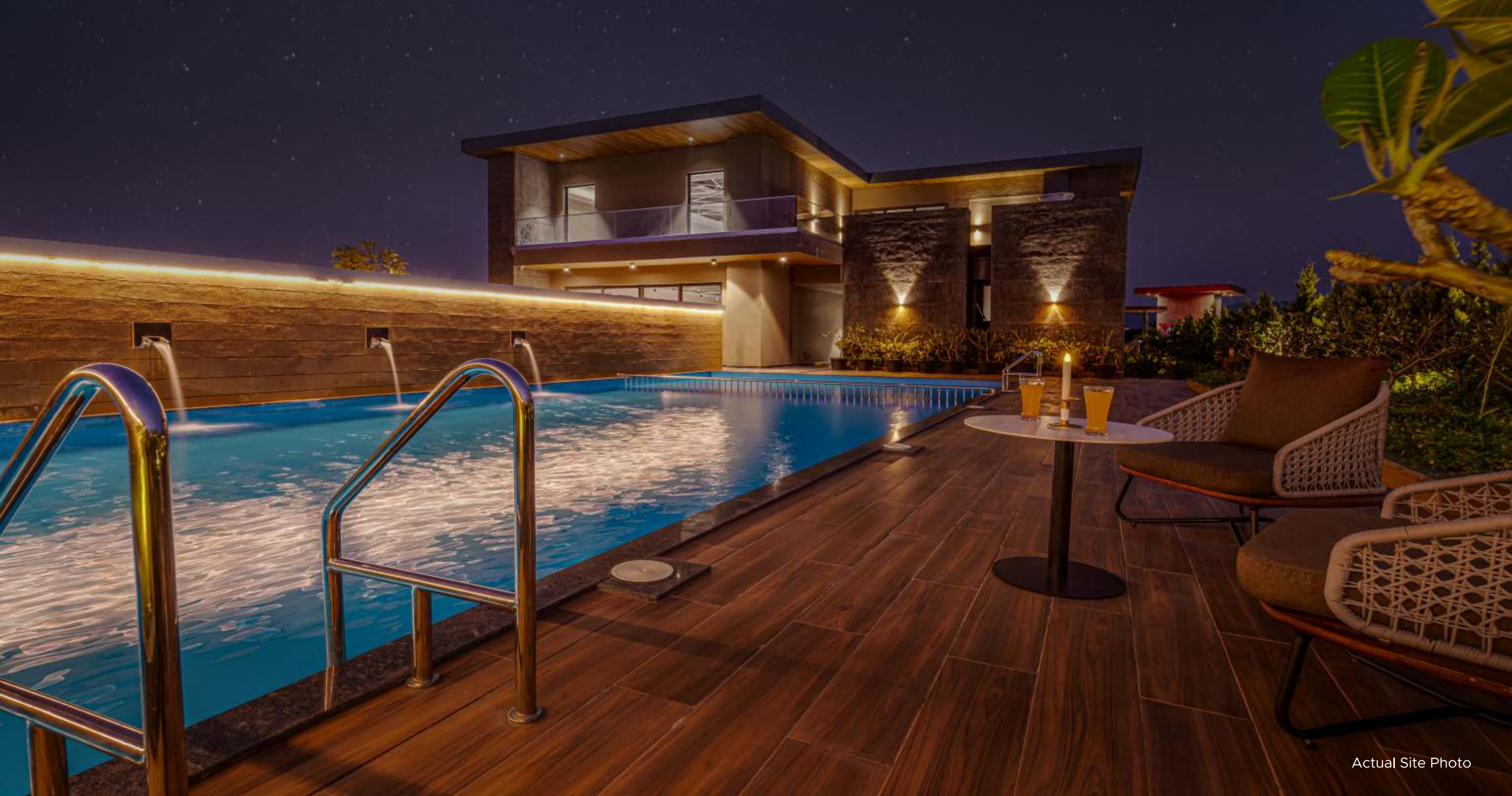
Actual Site Photo