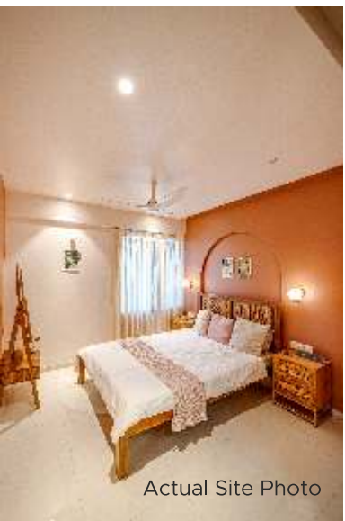
Actual Site Photo